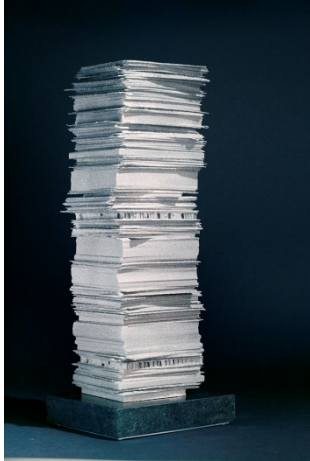
Statuette Internationaler Highrise Award Titanium and granite, 35 x 15 x 12 cm Artists: Thomas Demand

Thomas Demand is a reputed international photo artist and was brought on board by DekaBank to design the award statuette. Since 2004, the symbol of the International Highrise Award is made anew every two years and bestowed on the respective winner. The statuette consists of striking wafer-thin layers of titanium made using an electron-ray melting technology (EBM) which means they can be layered in almost any geometry at random. The process, which is otherwise mainly used to manufacture medical implants and in the aerospace and automotive industries, is currently considered the most innovative method of rapid manufacturing.