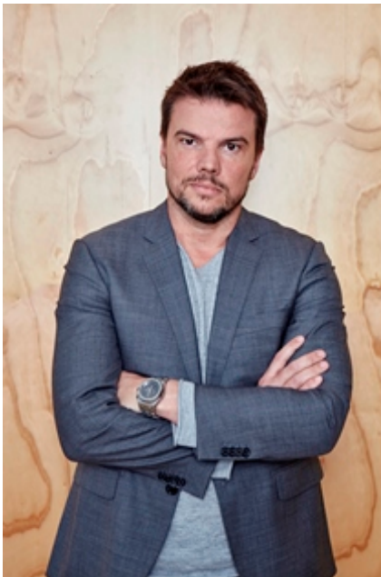
Bjarke Ingels, Architect and founder of BIG Bjarke Ingels Group

BIG is a Copenhagen and New York based group of architects, designers, builders, and thinkers operating within the fields of architecture, urbanism, interior design, landscape design, product design, research and development. The office is currently involved in a large number of projects throughout Europe, North America, Asia and the Middle East. BIG's architecture emerges out of a careful analysis of how contemporary life constantly evolves and changes. BIG believes that in order to deal with today's challenges, architecture can profitably move into a field that has been largely unexplored. A pragmatic utopian architecture that steers clear of the petrifying pragmatism of boring boxes and the naïve utopian ideas of digital formalism. Like a form of programmatic alchemy they create architecture by mixing conventional ingredients such as living, leisure, working, parking and shopping. By hitting the fertile overlap between pragmatic and utopia, the architects once again find the freedom to change the surface of our planet, to better fit contemporary life forms.